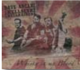
Whisky in my Blood (Blue North/Buzz – album 2013)