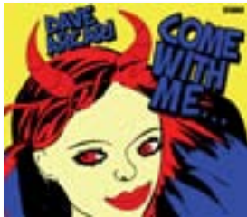
Come With Me (Buzz – album 2007)