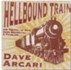
Hellbound Train (Buzz – EP 2016)

For full promo downloads and/or more info please call +44 (0) 1360 870248 or email studio@thebuzzgroup.co.uk