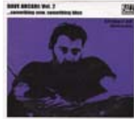
Vol.2 ...something new (Buzz – EP 2006)