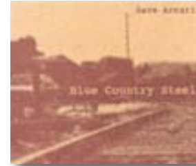
Blue Country Steel (Buzz – EP 2004)