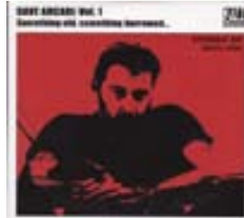
Vol.1 Something old... (Buzz – EP 2006)