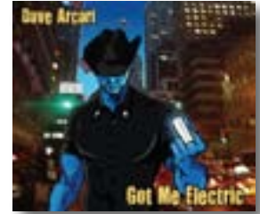
Whisky in my Blood (Blue North – album 2009)