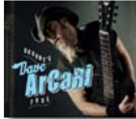
Nobody's Fool (Dixiefrog/Buzz – album 2012)