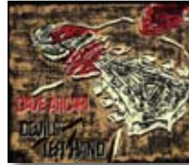
Devil's Left Hand (Buzz – album 2010)